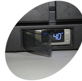
Protective thermostat cover